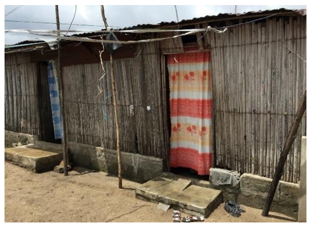
Household visited during user research on portable tenant toilets in Cotonou, Benin.

The goal of the SSD project is to improve urban sanitation outcomes through developing scalable, market-based models that contribute to structural change within the region's sanitation sector with an initial focus on the cities of Cotonou (Benin), Abidjan (CDI), and Accra (Ghana), and Kumasi (Ghana).