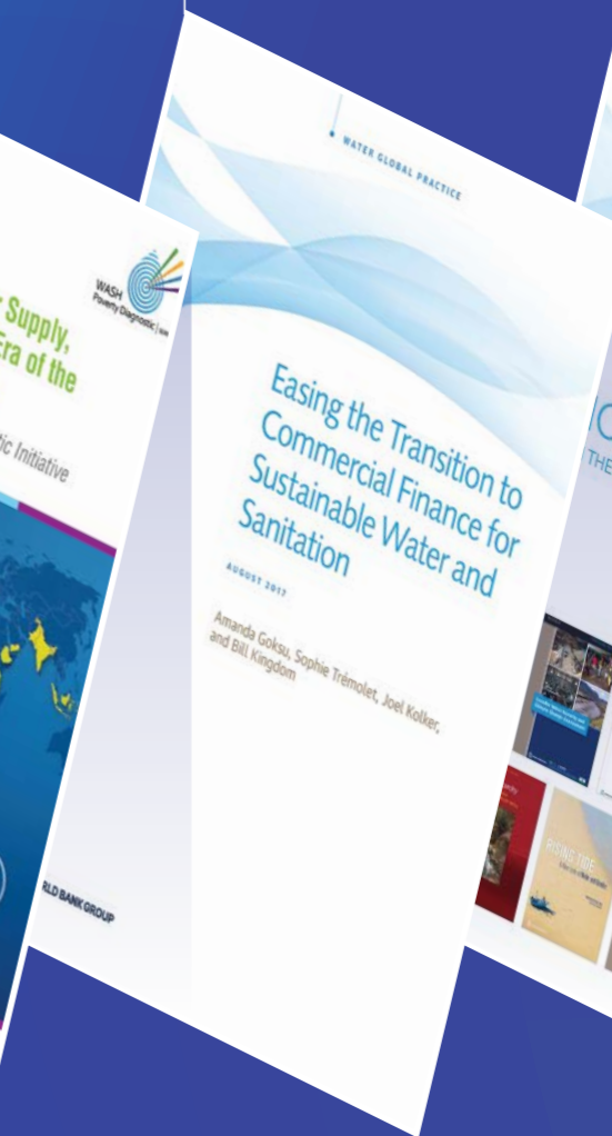
Easing the Transition to Commercial Finance for Sustainable Water and Sanitation