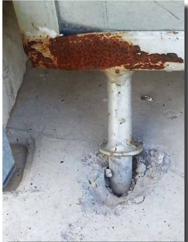
Figure 21: All steel components must be hot dip galvanised or they will not last. Also, attention needs to be given to the alignment and strength of the door swivel pins and the swivel sockets.