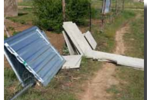
Figure 13: On-site delivery of everything that is required for the superstructure, ready for assembly: two floor slabs, a galvanised steel frame, nine wall panels, the galvanised steel door and the galvanised steel roof (complete with frame).