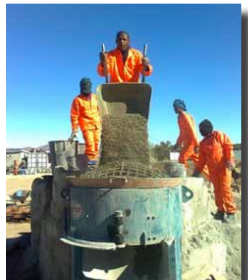
Figure 8: At the Maggie Resha Zone Site in Maluti a pan mixer is used to prepare the aggregate and cement for the casting of blocks