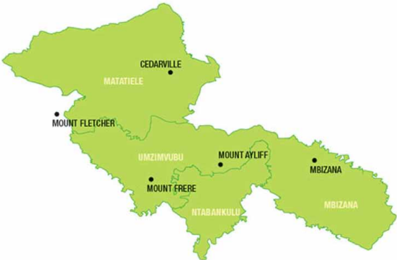
Figure 2: The ANDM is now made up of four local municipalities: Matatiele; Umzimvubu; Ntabankulu; and Mbizana