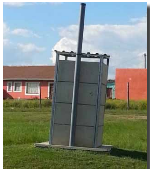
Figure 22: Many of the precast VIPs seen near Mt Ayliff are not vertical. Better specifications and quality standards are needed.