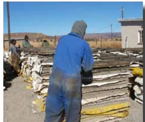
Figure 7: The use of an innovative stacking system makes it possible to cast large numbers of slabs in a relatively small area