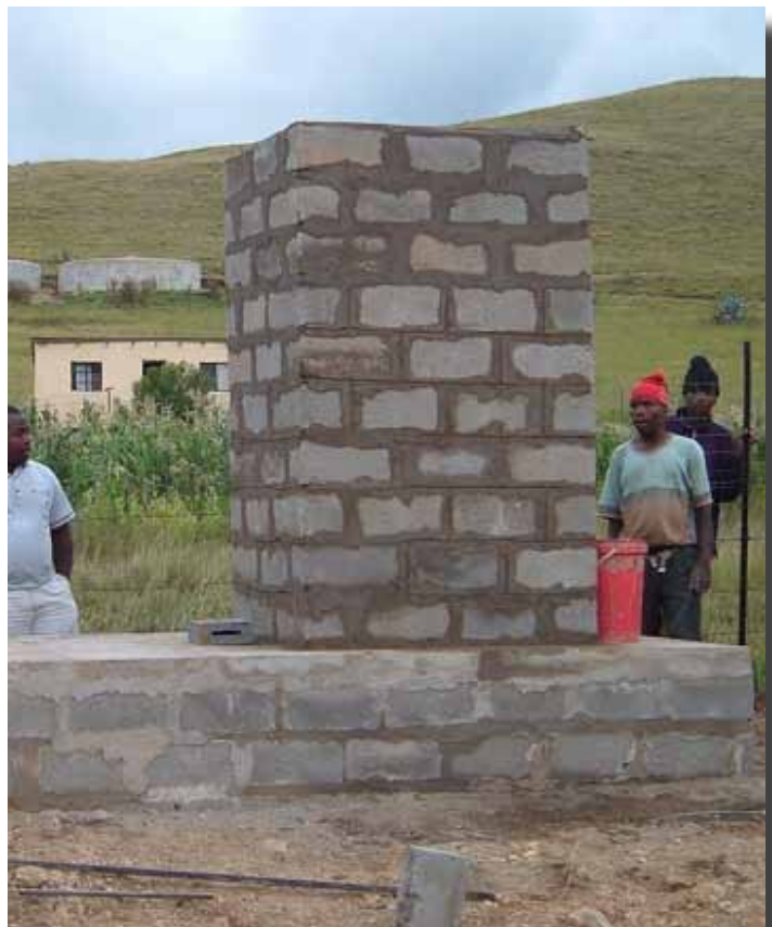
Figure 18: A raised and extended pit is used where there is inadequate soil depth. The usable pit volume should be at least 2 m 3 to give a pit a design life of 7 years or more, but larger is better.