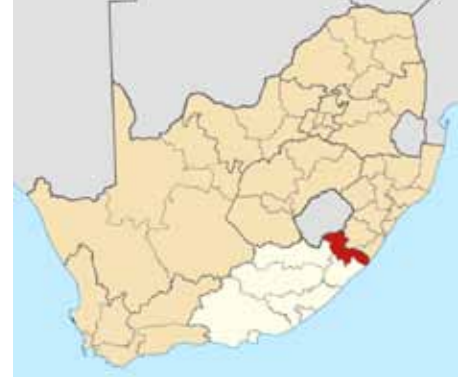
Figure 1: The Alfred Nzo District Municipality shown highlighted on the map of South Africa

The Alfred Nzo District Municipality in the Eastern Cape is bounded by the Drakensberg escarpment and the Lesotho border in the west, the Indian Ocean in the east, the KZN District Municipalities of Sisonke and Ugu in the north and the Eastern Cape District Municipalities of Joe Gqabi (formerly Ukhahlamba) and OR Tambo in the south (Figure 1). When it was first demarcated in 2000 it comprised three local municipalities, namely Matatiele, Umzimvubu and Umzimkhulu. After the 2006 local government elections the latter was re-demarcated into Sisonke, and after the 2011 elections the local municipalities of Bizana and Ntabankulu (previously under the OR Tambo district) were incorporated into the ANDM. The population of the district has over the past decade therefore first decreased and now increased. Its present level is estimated at 801 344 people and 169 261 households.