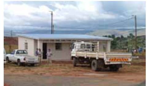
Figure 4: The MSZC provides a base from which sanitation provision for an area with typically about 15 000 homes can be planned and managed.