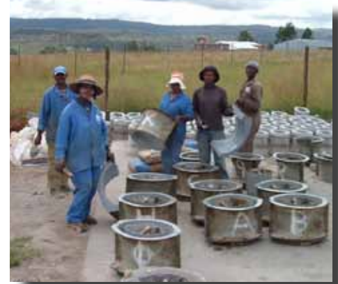
Figure 6: During the first two phases pedestals were made at the zone sites. Lately the programme has switched to plastic pedestals, which have the advantage of being easier to transport, and which are also easier to keep clean when in use

With up to 100 toilets being built in each zone per week, the space required to cast the slabs presented a problem. A newly cast slab cannot be moved for up to a week while the fresh concrete cures and increases in strength. An innovative system was developed using removable spacers and plastic sheets which allowed the slabs to be cast one on top of each other, greatly reducing the space required for a large pre-casting operation.