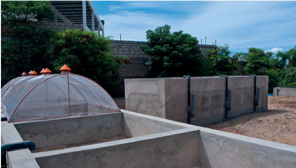
Figure 7.6 Pilot scale research facility at Cambérène treatment plant, Dakar, Senegal. Evaluating rates of dewatering with passive and active ventilation with greenhouses.

A further option is to use stainless steel wedge wire as a surface to enhance sludge drying and drainage, or to reduce the amount of sand that partitions with the sludge upon removal (Tchobanoglous et al. , 2002). Whilst this is effective for the drying of wastewater sludge its effectiveness for FS drying has not yet been reported.