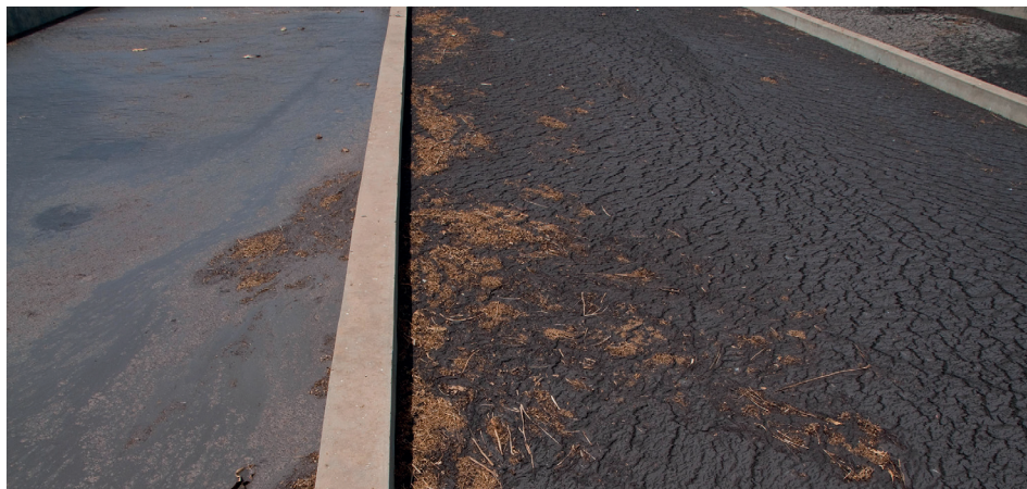
Figure 7.2 Freshly loaded and partially dewatered faecal sludge on unplanted drying beds at Niayes faecal sludge treatment plant, Dakar, Senegal.