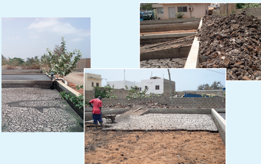
Figure 7.6 Unplanted drying beds, sludge removal and accumulation at Cambérène treatment plant, Dakar, Senegal.

As presented in Case Study 6.2, the Cambérène FSTP is a combination of settling/thickening tanks and unplanted drying beds. The drying beds were designed based on a 200 kg TS/m 2 /year loading and a 20 cm deep sludge layer. The operator considers the sludge sufficiently dried when it can be easily removed with a spade, i.e. when the sludge is not sticking to the sand layer anymore. In the climatic conditions of Dakar, this corresponds to 30-35 days drying, even during the rainy season. The dry matter content reaches about 50%, which is an average, with a drier layer on top and 20-30% dry matter in the deeper layer of the sludge. As the operator takes one week more for organising the dried sludge removal, each of the 10 beds of 130 m 2 takes 40 day cycles. This leads to an effective loading rate of 340 kg TS/m 2 .year. As a consequence, the operator usually uses only 6-7 beds instead of the 10 beds.