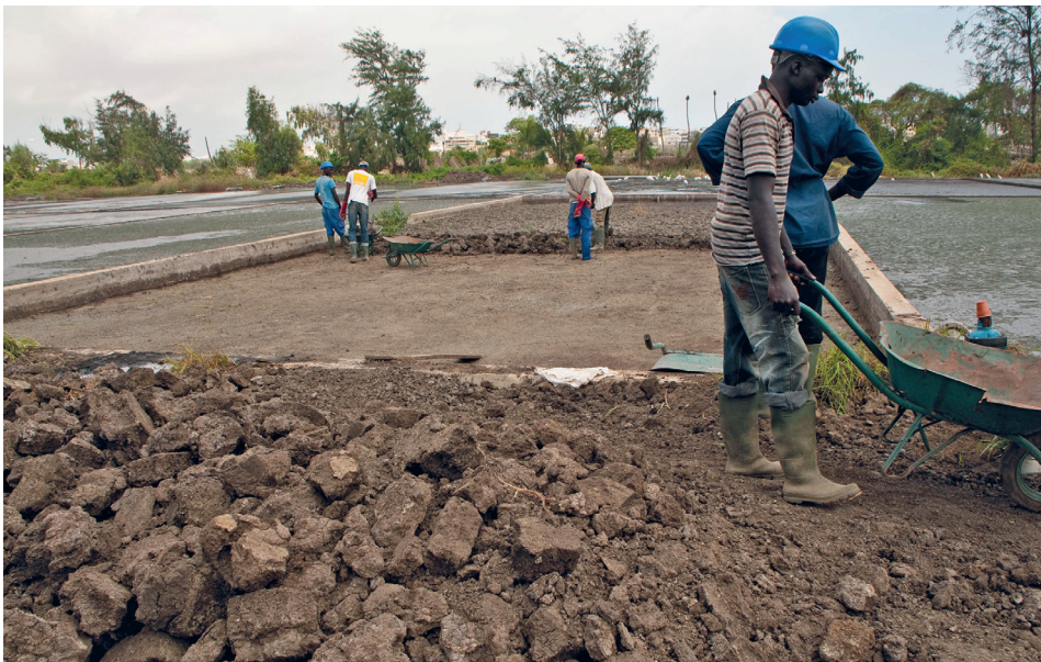
Figure 7.5 Removing sludge from unplanted drying beds at Cambérène treatment plant, Dakar, Senegal.

Rewetting of the sludge is considered problematic if rainfall occurs before the free water of the sludge is completely drained. In this case, the moisture content of the sludge increases again and the drying period is prolonged. When the sludge is already dry enough to expose the sand layer through the cracks in the sludge, rain water can pass straight through the sludge and drains through the drying bed.