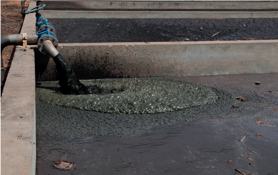
Figure 7.4 Loading of the beds at Niayes faecal sludge treatment plant, Dakar, Senegal.