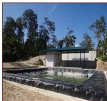
Figure 2. Effluent storage pond