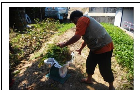
Figure 3. Fertilizer experiment plot