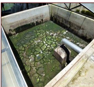
Figure 1. Sand gravel bed

To ensure correct faecal management in the camp and that the service is accessible to all camp residents, SI created a Beneficiary Selection Grid that is used to define if a “services fee” is applied; the criteria used include the status of the requester (camp resident/ agencies/ Community Based Organizations/ Camp authorities), the location of the latrine pit (whether inside or outside the camp or in surrounding villages) and the type of structure (public: hospital, health centers, schools, or private). This strategy was determined in order to offer free service to very vulnerable camp residents, and the fees were set to keep the service attractive if the STU was to be transferred in the future (service fees covered by external service users to cover part of STU running costs).