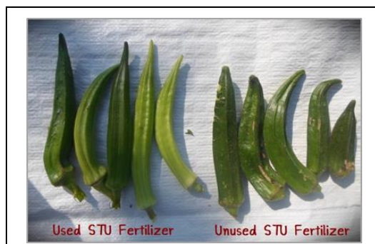
Figure 4. Fertilizer test results