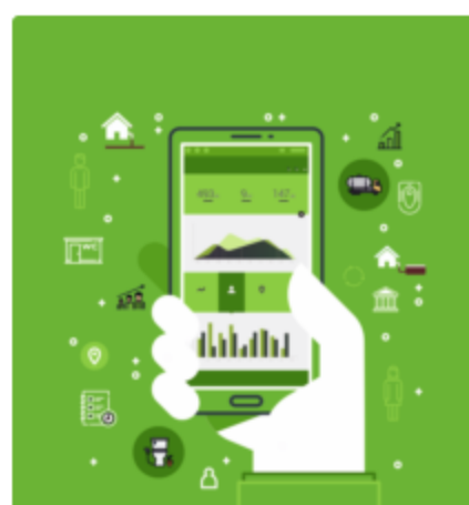
KARUNGUZZHI DESLUDGING TOOL User Manual February 2016