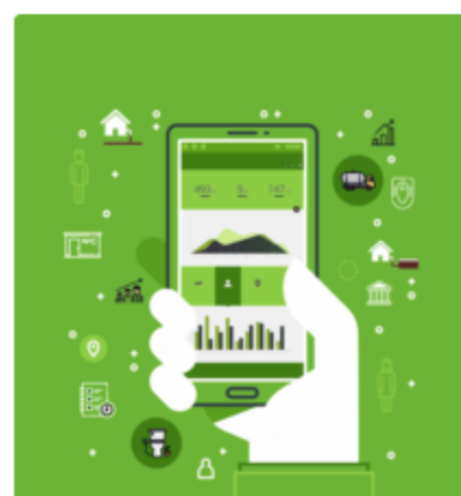
KARUNGUZZHI DESLUDGING TOOL Administrator Manual February 2016