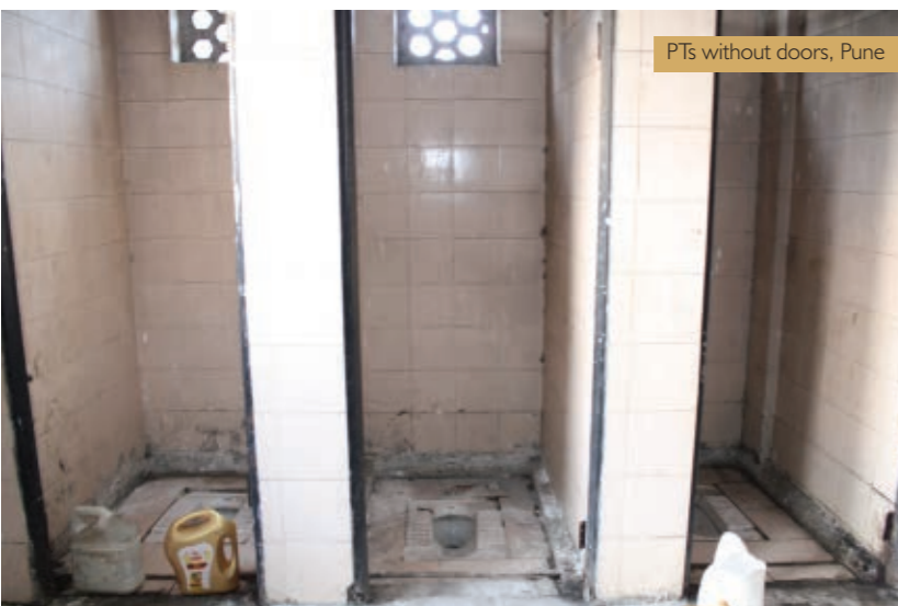
PTs without doors, Pune