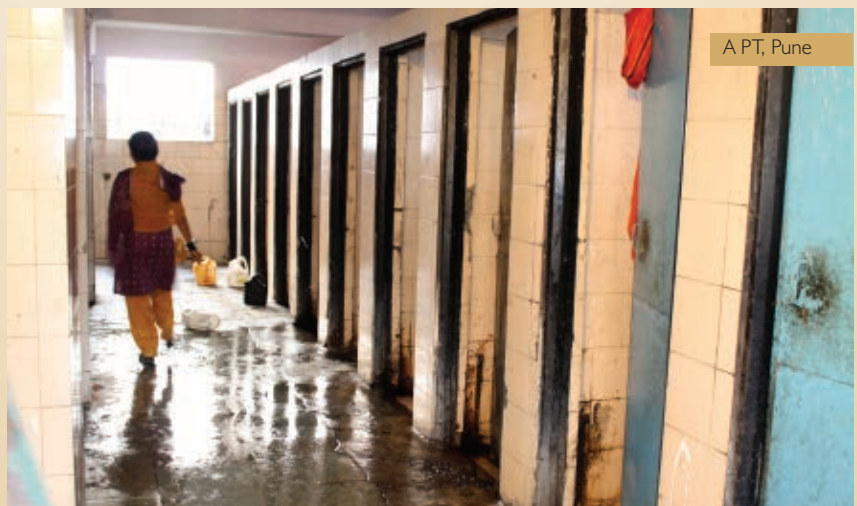
A PT, Pune