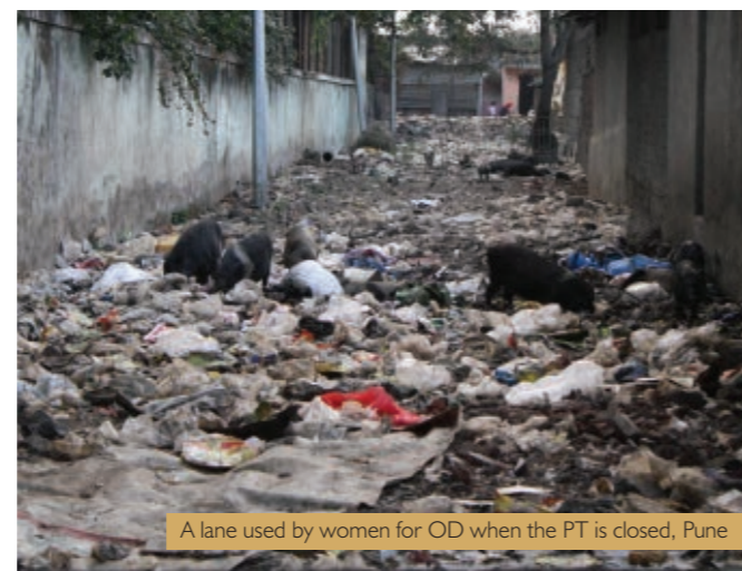
A lane used by women for OD when the PT is closed, Pune

Since public toilets are not child-friendly women often take them to the streets to defecate much to the ire of different classes of people—the morning walkers or the street cleaners or those who live on footpaths.