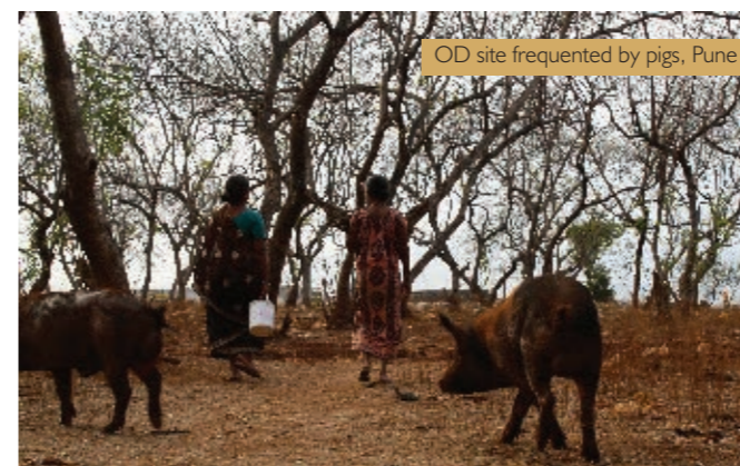
OD site frequented by pigs, Pune

One of the strongest recommendations from the women was improved maintenance of public toilets and making it affordable.