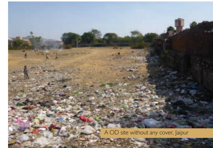
A OD site without any cover, Jaipur

Steep and slippery sites and railway tracks have often led to accidents. This danger was narrated by several women reporting instances of women slipping down, breaking their legs or simply getting killed in railway accidents. Similarly canal