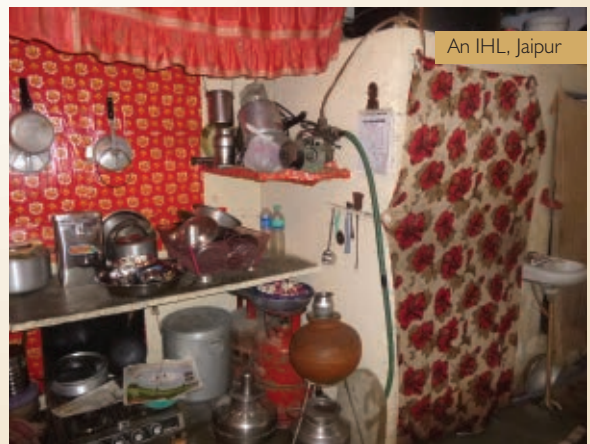
An IHL, Jaipur