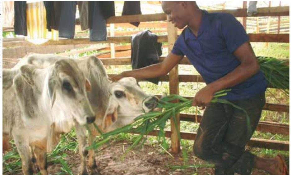
Photo 1: Demand for urban and peri-urban dairy products is increasing worldwide. Natural pasture is limited and decreasing steadily due to climate change. Forage plants and cash crops can be grown on excreta and wastewater treatment works to contribute to livestock production and urban food security.