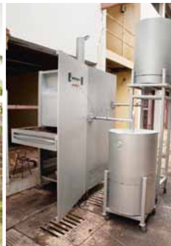
Photo 2: Pilot-scale kiln for brick production in Kampala (left) and for waste oil regeneration in Dakar (right).

dustrial kilns. Depending on the local market, this enduse can provide high revenues and hence increase FS management services. Tapping this revenue potential would require increasing and improving FS collection and transport services, which would lessen the environmental and public health impact of FS, as well as developing treatment systems to scale up FS fuel production.