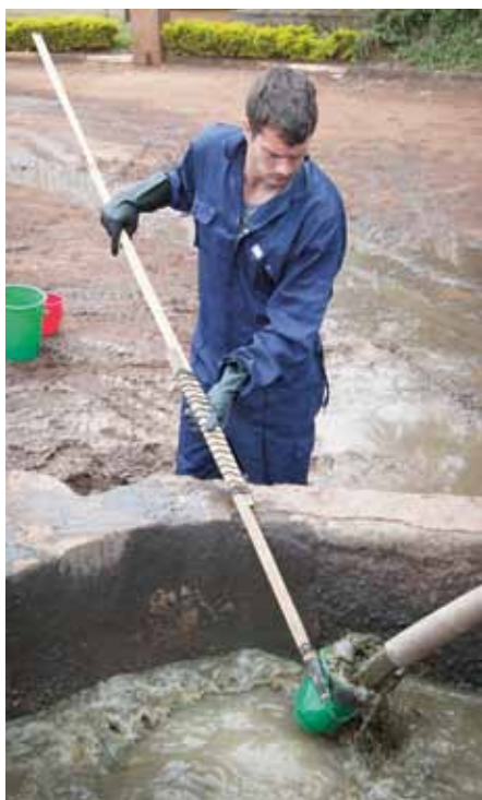
Photo 1: Sampling of faecal sludge at the influent of Bugolobi WWTP, Kampala.

The results indicated that approximately 114 trucks discharge FS per day at Bugolobi, delivering an average volume of 577 m 3 FS. Although both weeks had similar results, they are not necessarily reflective of how much FS is delivered over the entire year as this is also influenced by conditions, such as the rainy and dry seasons.